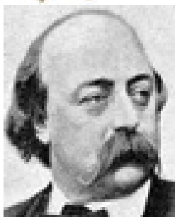
Jean de La Fontaine