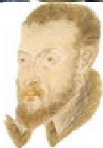
Joachim Du Bellay